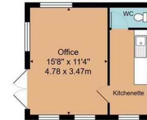
Office 15'8" x 11'4" 4.78 x 3.47m